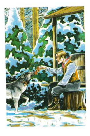
Beauty Smith came back with a large stick.

What will happen next? Match the pictures with the events: