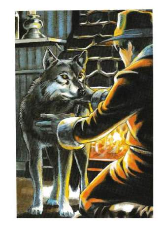
Matt pulled White Fang's neck out of the dog's teeth.